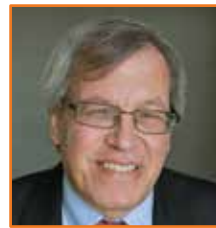
Erwin Chemerinsky Dean UC Irvine School of Law